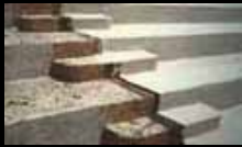
Don't Replace It, Miracote It!