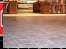
Don't Replace It, Mirastamp It!