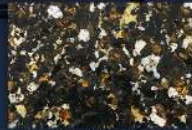
LEATHER TINT - CANYON CLAY