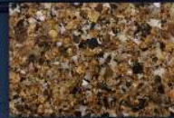
COPPER CRUSADE TINT - CANYON CLAY