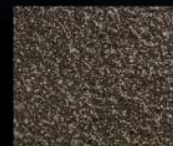
STREAM WOOD TINT - CANYON CLAY