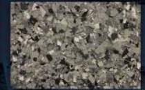
GAUNTLET GRAY TINT - MEDIUM GRAY