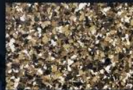
DRAW BRIDGE TINT - CANYON CLAY