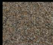
RIDGE VIEW TINT - CANYON CLAY