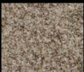
PEBBLE BEACH TINT - BUFF