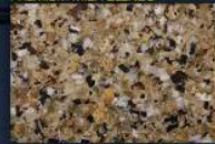
GOLD CREST TINT - SUN BUFF