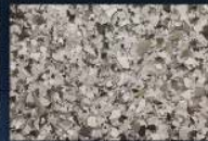
CHAINMAIL TINT - BUFF