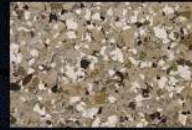
KINGS RANSOM TINT - BUFF