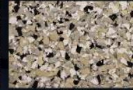
CAMELOT TINT - LIGHT GRAY