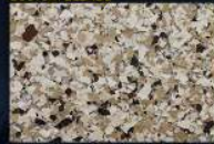
CLIFFS EDGE TINT - SUN BUFF