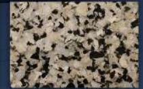
SILVER SABER TINT - LIGHT GRAY