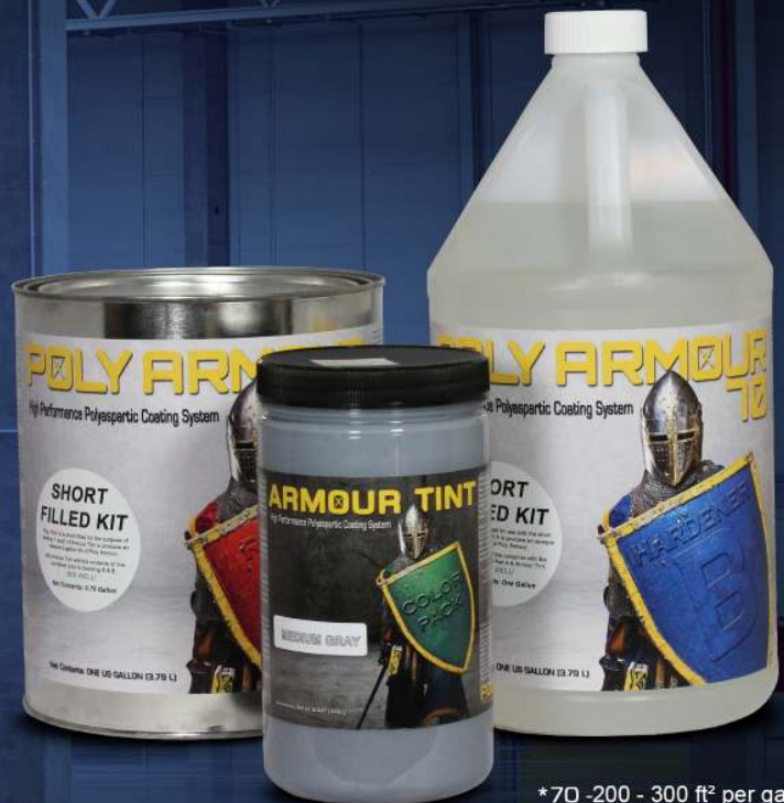
Armour tint sold separately

*70 -200 - 300 ft² per gallon* *80sc -200 - 300 ft² per gallon* *100 -100 - 250 ft² per gallon*