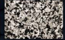
KNIGHTS TOWER TINT - LIGHT GRAY