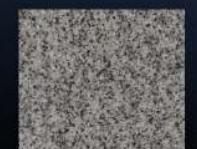
SILVER SHADOW TINT - LIGHT GRAY