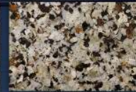
GALLIANT TINT - BUFF