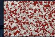
BUCKEYE TINT - LIGHT GRAY