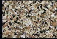
WATCH TOWER TINT - SUN BUFF