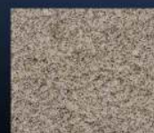
NATURAL BEIGE TINT - BUFF