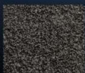
GRANITE TINT - MEDIUM GRAY