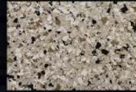
CASTLE GATE TINT - SUN BUFF